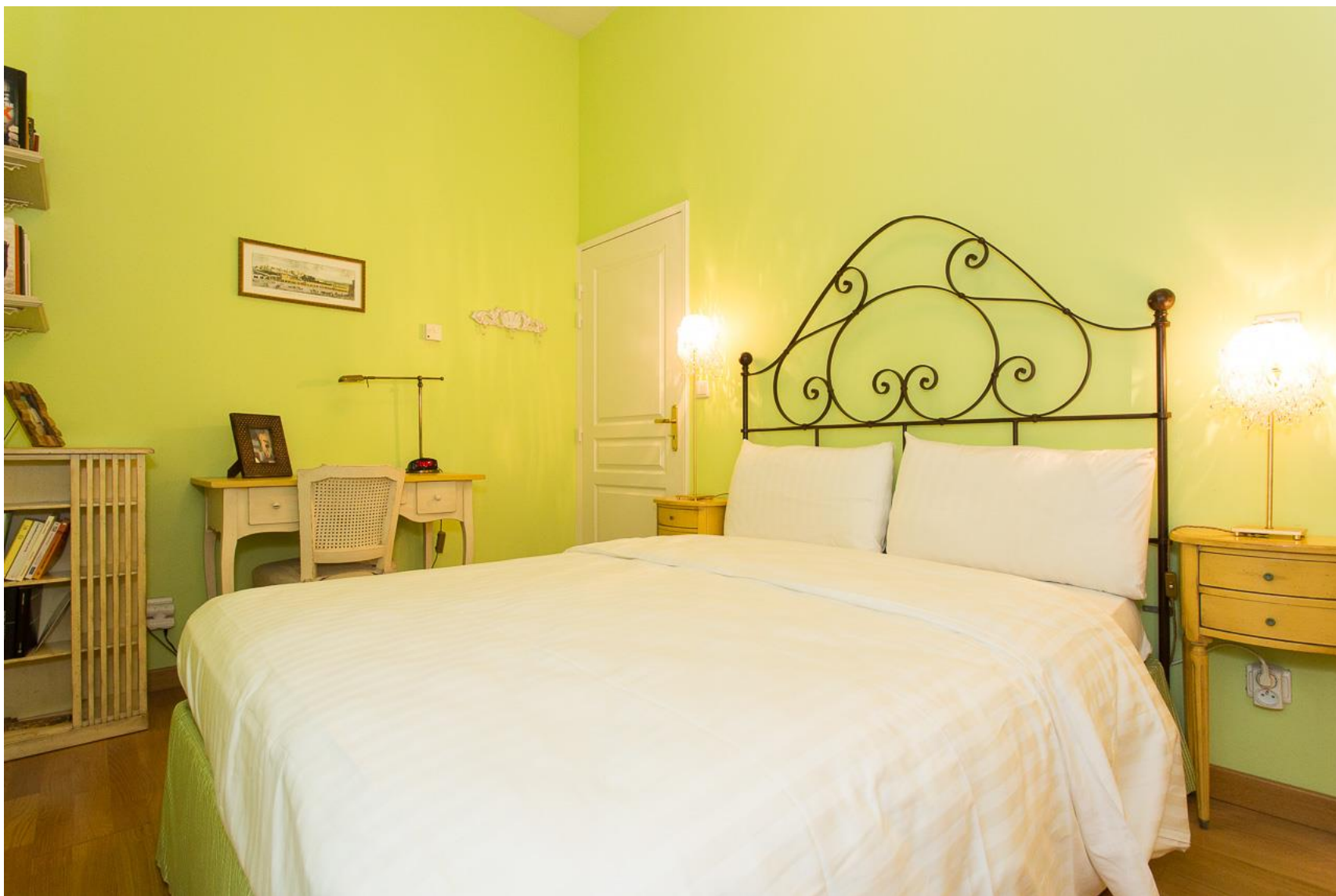
Ensuite master bedroom