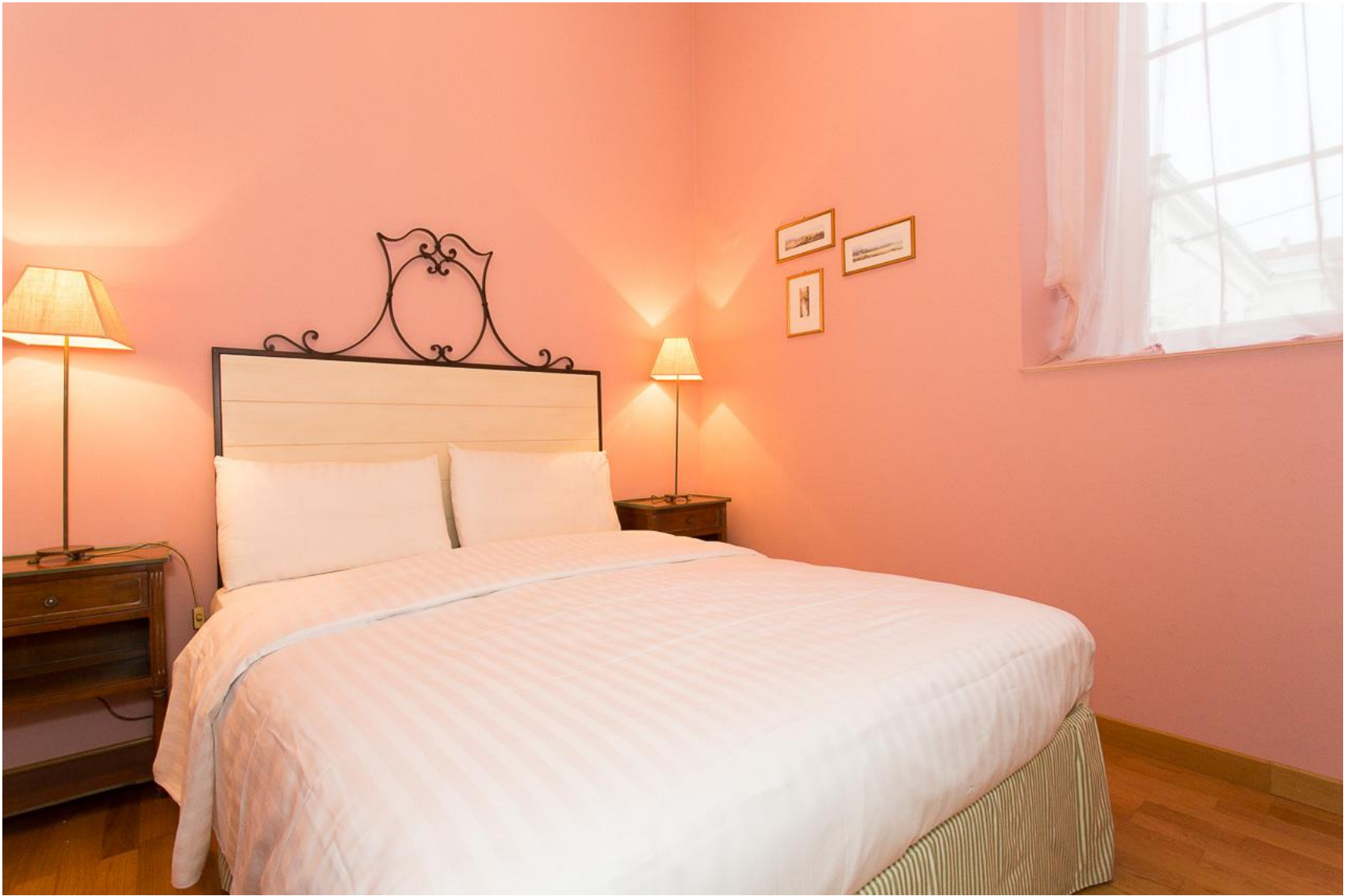
2 nd bedroom