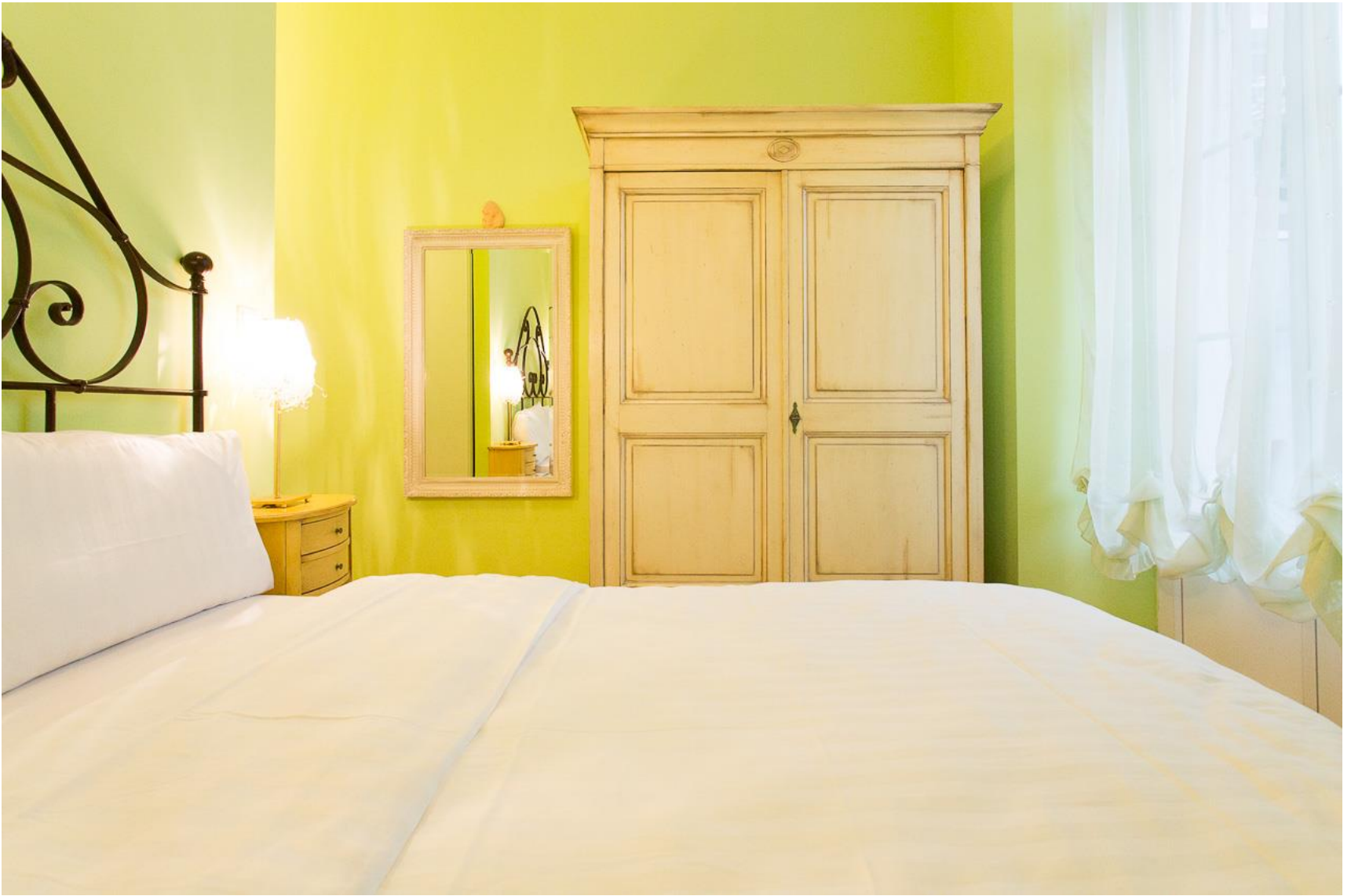
Another view of the ensuite master bedroom