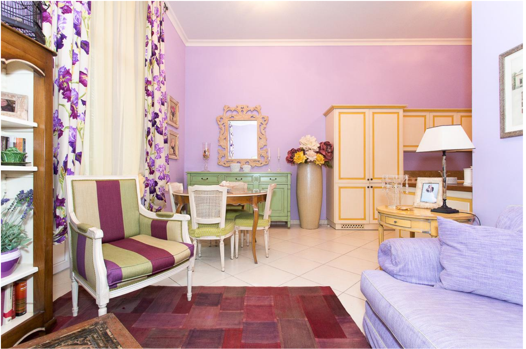
Another view of the living room