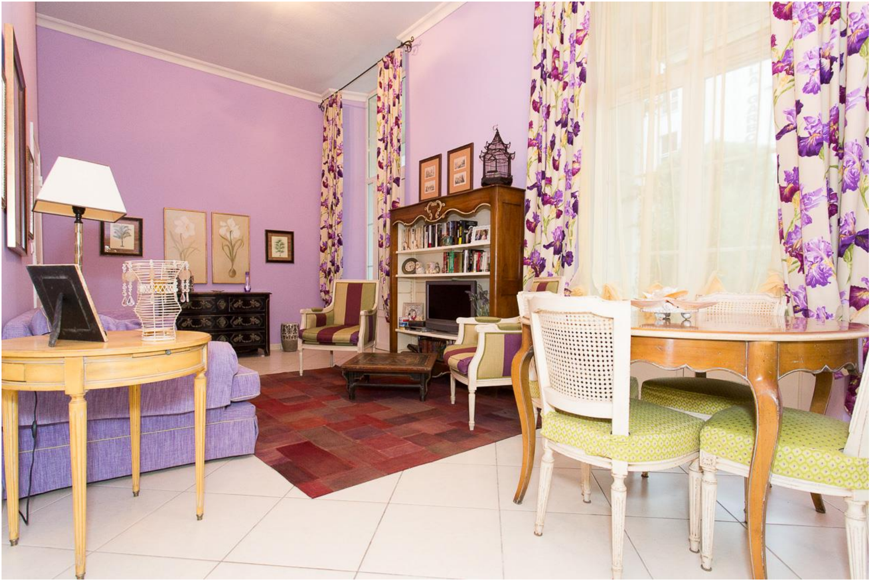
Living room & dining area opening onto the terrace