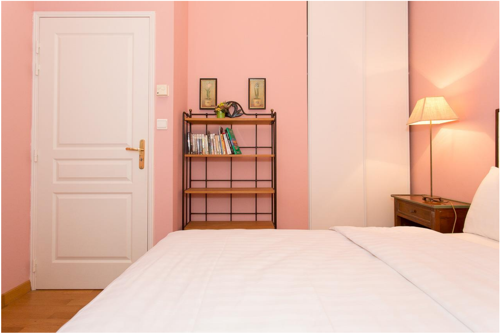
Another view of the 2 nd bedroom