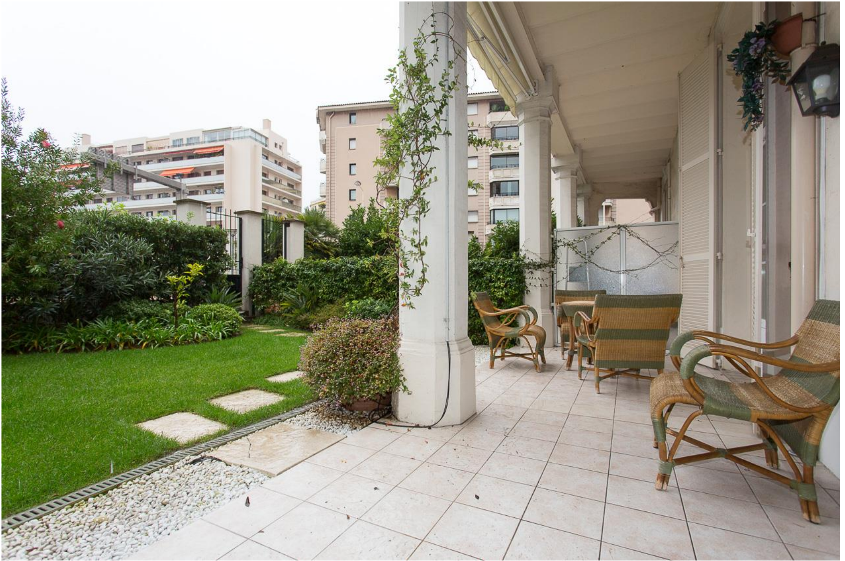
The terrace & garden on a rainy day! Yes, rain happens sometimes in Cannes ;-)