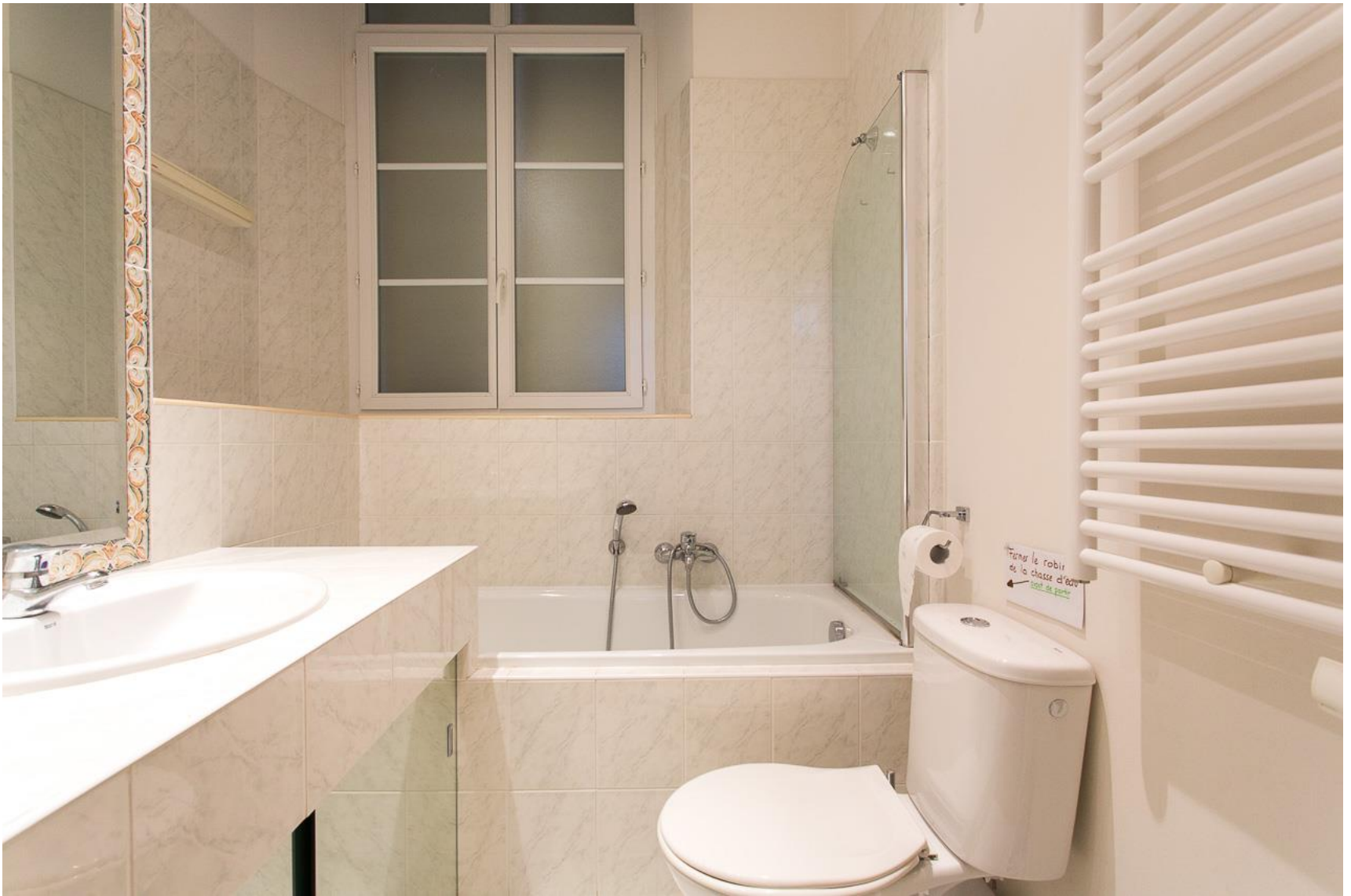
Bathroom with toilets belonging to master bedroom