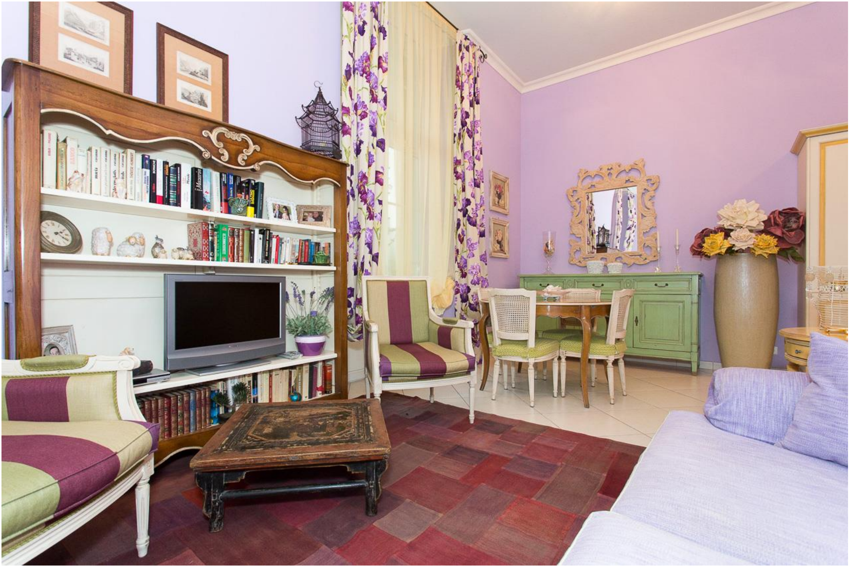
Living room with couch & armchairs