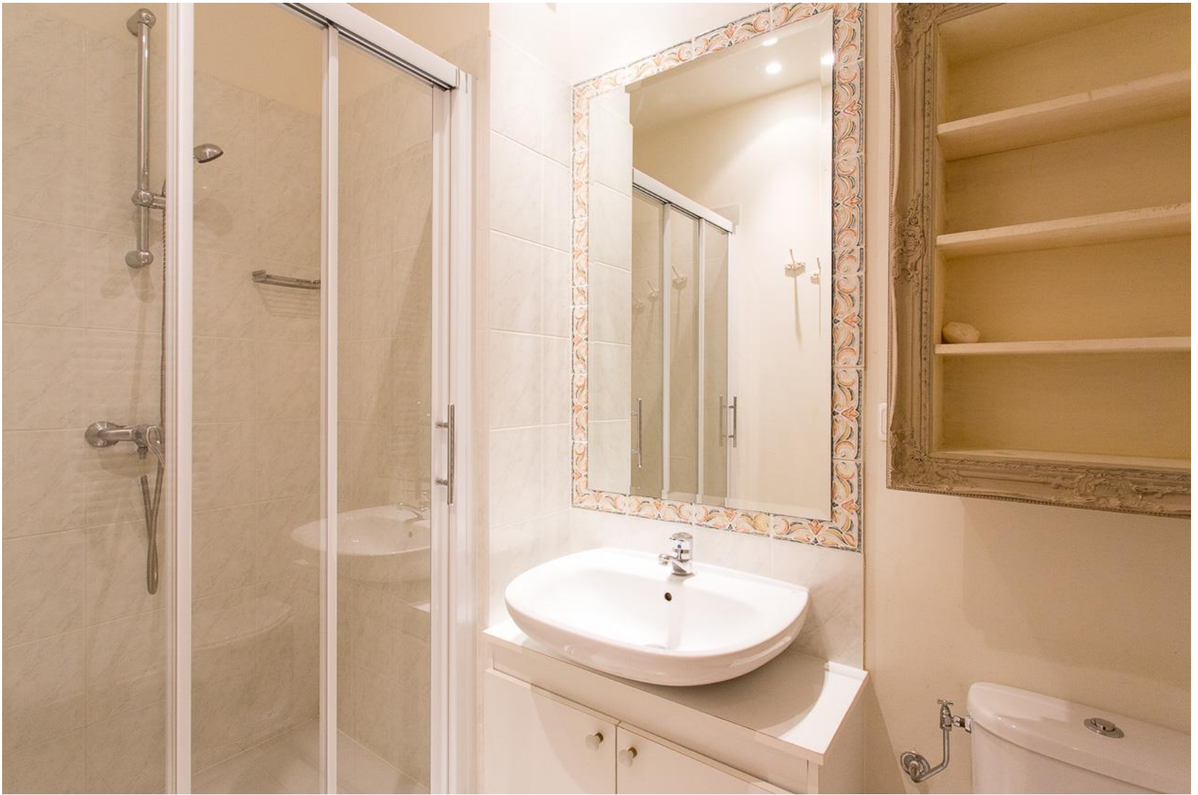
Shower room with toilets