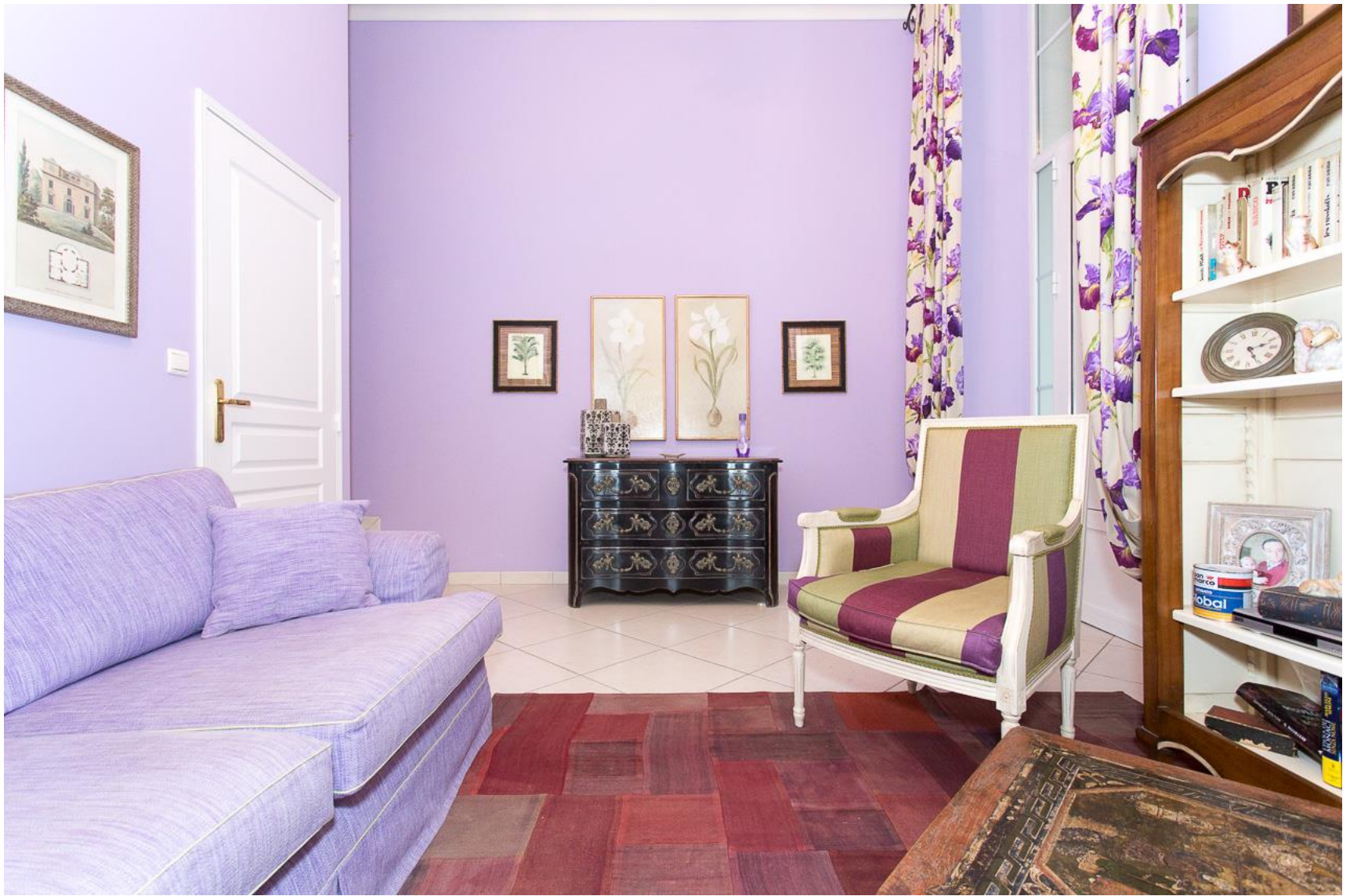
The living room...Purple is the new trend!